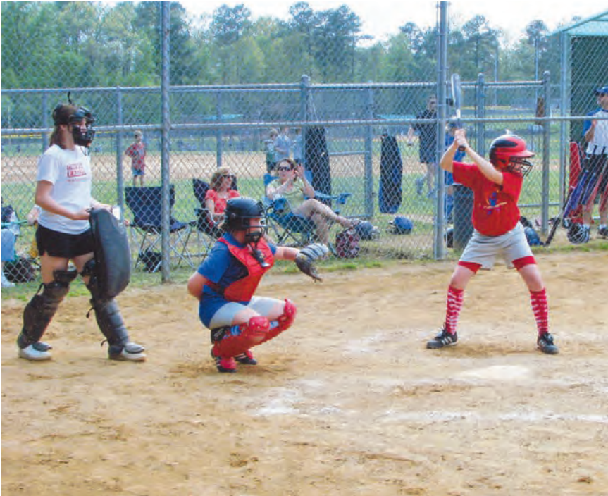
Photo: Girls playing a youth league softball game in Richmond, Virginia, April 2008.