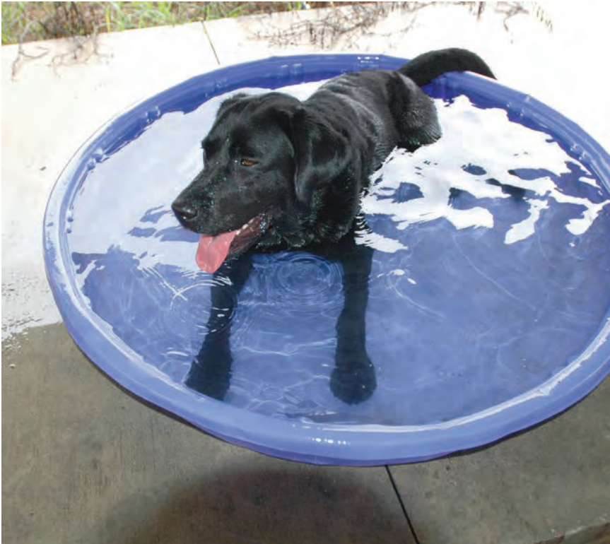
Photo: A search-and-rescue dog in training takes a break in a wading pool in Orlando, Florida, June 2005. Taken by Leif Skoogfors. Released into the public domain by FEMA.