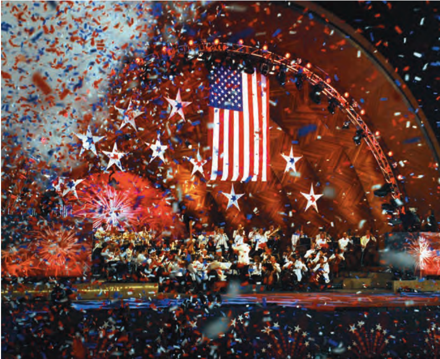
Photo: Confetti rains down at a July 4th celebration featuring the Boston Pops Orchestra in Boston, Massachusetts, July 2008.