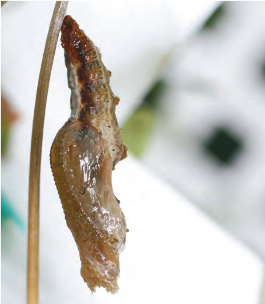
Photo: Pupa of Gulf Fritillary butterfly ( Agraulis vanillae ) in its cocoon, near Pompano Beach, Florida.