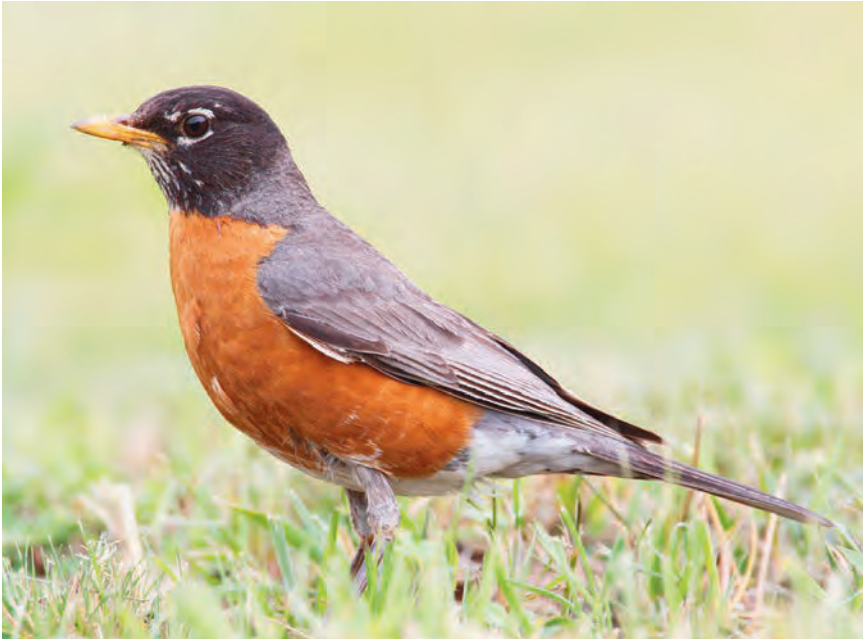
Photo: American robin ( Turdus migratorius ) Humber Bay Park (East), Toronto, Canada, 2005.