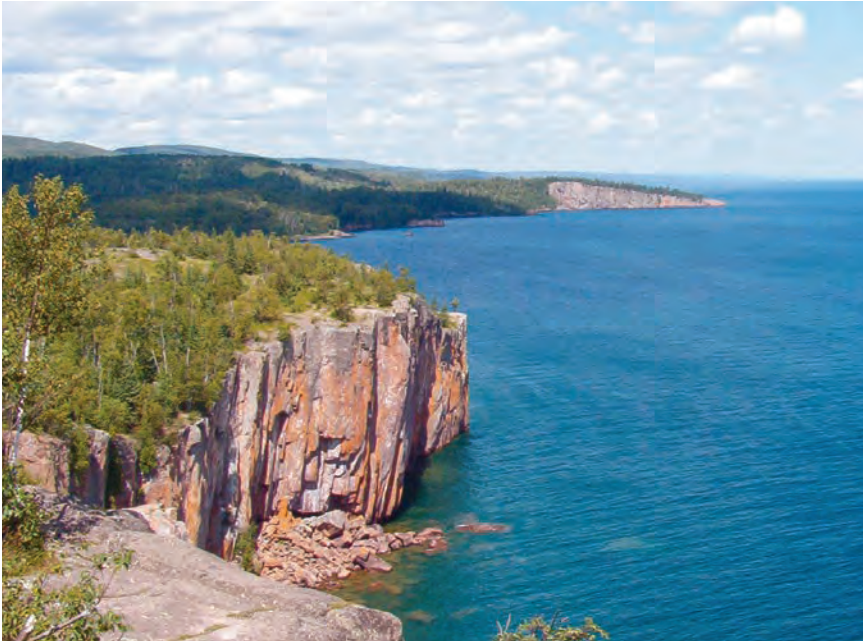
Photo: View from Palisade Head in Minnesota's Tettegouche State Park on the North Shore of Lake Superior, August 2008.