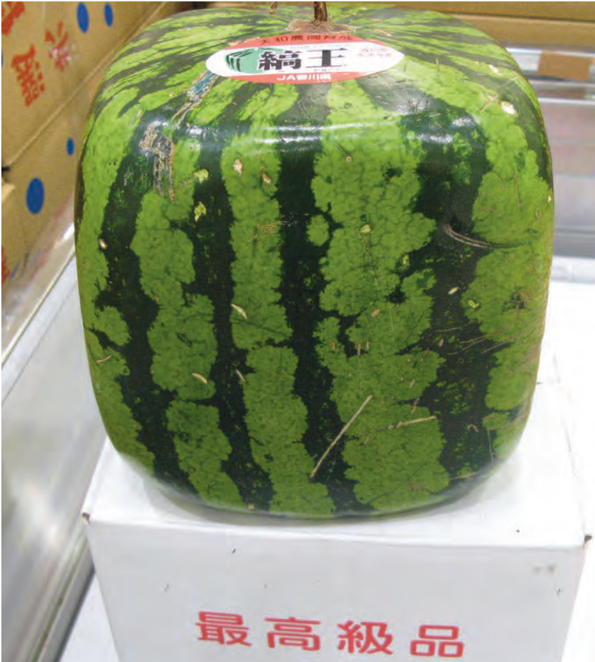
Photo: A square watermelon for sale in a shop in Japan, January 2007.