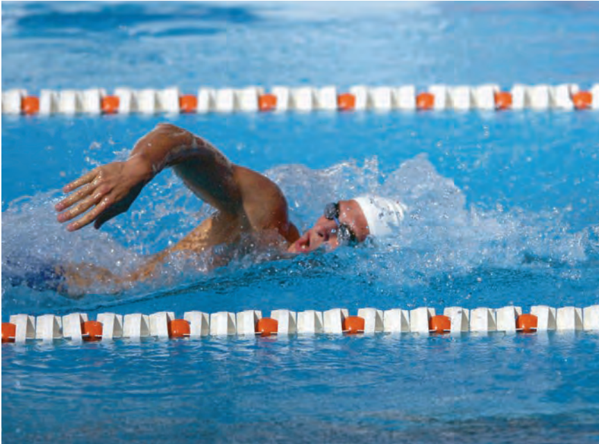
Photo: A U.S. Air Force officer swims in a race at the Military World Games in Hyderabad, India, October 2007.