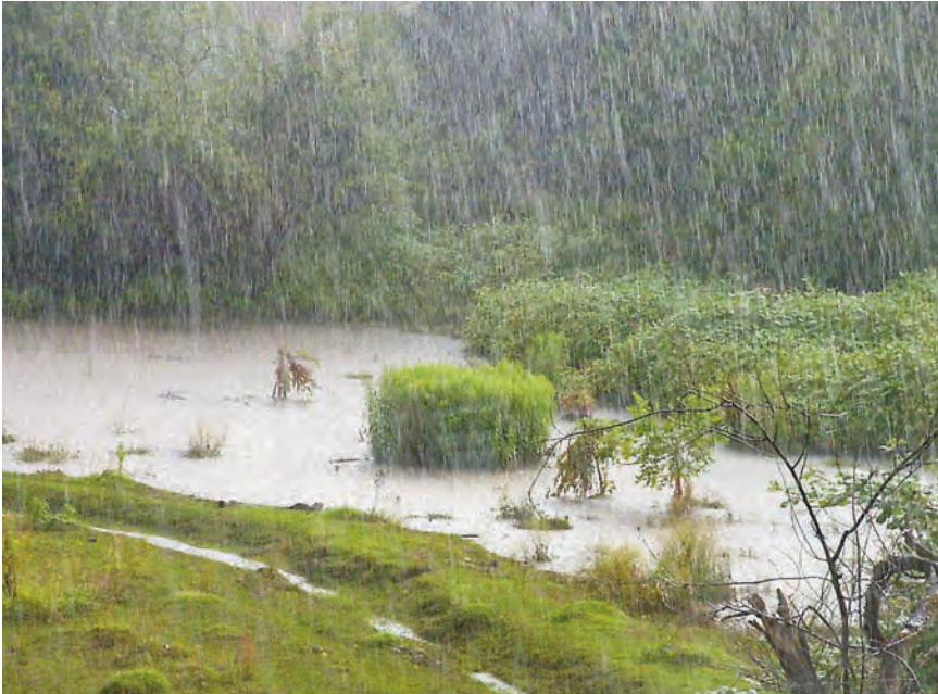
Photo: Rain falls on a field in Germany during a storm in 2006.