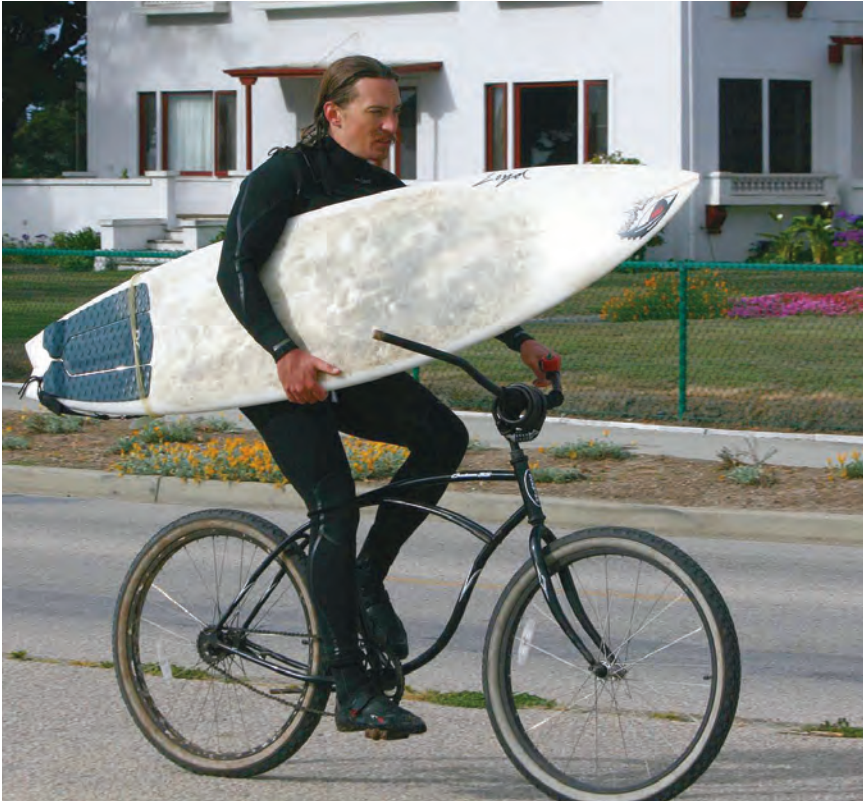
Photo: Bicycling to the surf in Santa Cruz, California, April 2009. © 2009 by Richard Masoner. Some rights reserved ( http://creativecommons.org/licenses/by/2.0 ).

When we think of inventions, we often think of serious things like medicine and computers. Inventions in medicine and computers have made our lives much better. But there are also inventions that make it possible to have fun and play. Some of the most exciting inventions of the last 100 years have to do with bicycles and boards.