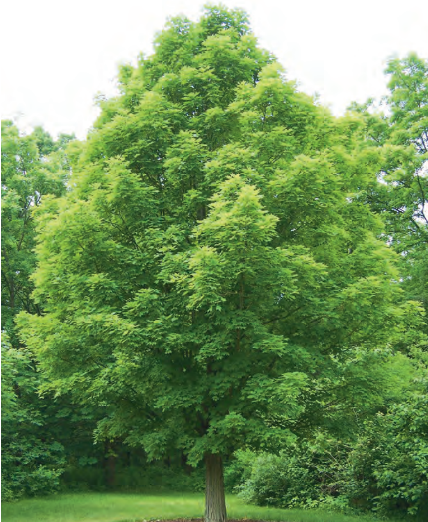
Photo: Sugar maple tree ( Acer saccharum ) at Morton Arboretum, Lisle, Illinois, May 2007.