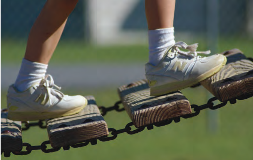
Photo: A child wearing athletic shoes walks across a swaying bridge in Jacksonville, Arkansas, September 2007.

When the temperature goes up, it's time to put your winter boots away and get out your summer footwear. Long summer days mean games with friends and visits to parks. You don't want to be wearing winter boots when you're playing soccer or walking at the beach. It's time for sandals and tennis shoes. If you go swimming, you might want to try a pair of swimming fins.