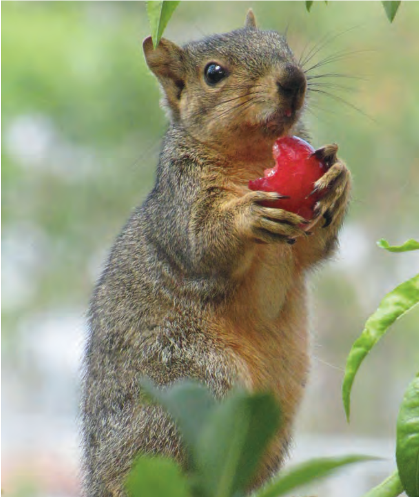
Photo: A fox squirrel ( Sciurus niger ) eats a Santa Rosa plum in Fullerton, California, May 2009. © 2009 by Davefoc at Wikimedia Commons. Some rights reserved ( http://creativecommons.org/licenses/by-sa/3.0 ).