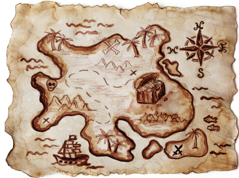
In Treasure Island , the discovery of an old pirate map leads to many adventures.

Like Mel Fisher, some hunters focus on shipwrecks. The ocean floor is littered with thousands of sunken vessels. Some of them still carry gold, silver, and precious objects. Other treasure hunters search on land for lost stashes. Perhaps a criminal buried stolen money and never came back for it.