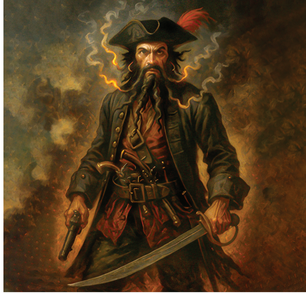
The pirate Edward Teach was known as "Blackbeard."

The pirates swarmed over the fence like monkeys. Jim's friends, led by the Squire, fired back again and yet again. Three of the pirates fell. But of these, one was clearly more frightened than hurt, for he was on his feet again