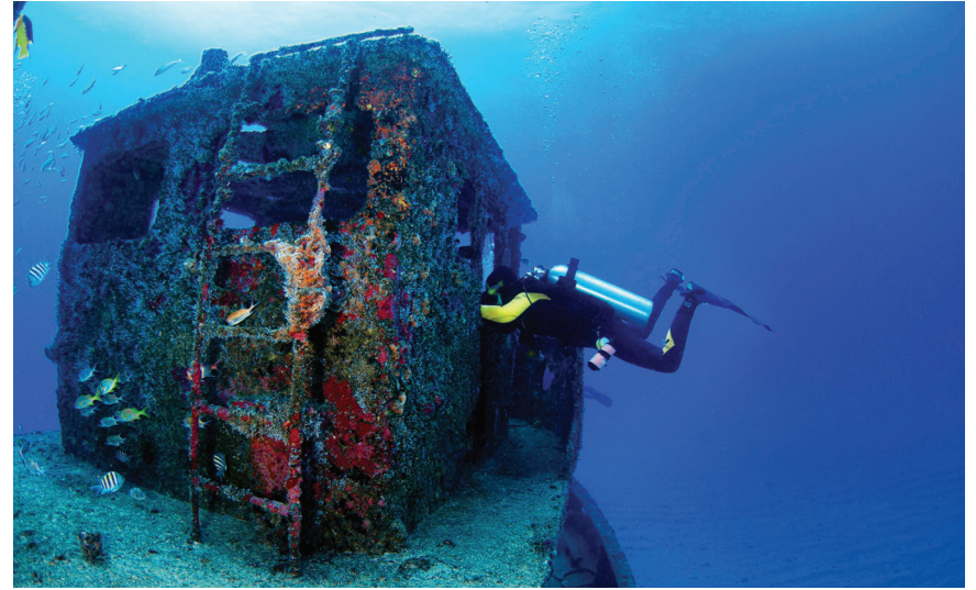
In 2015, a Spanish company discovered treasure in a shipwreck like the one pictured. It was worth $17 billion in gold and silver!

When the ship reaches Treasure Island, the crew splits into two groups. One group is led by Captain Smollett, Dr. Livesey, and Squire Trelawney. The other group is led by Silver and is made up of the pirates. Jim gets caught