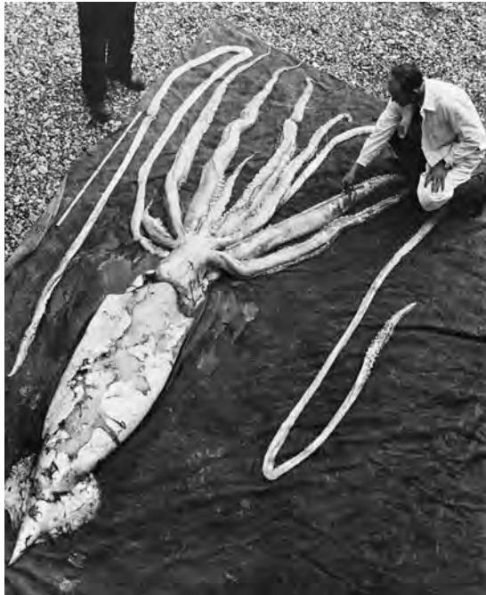
In 1954, the carcass of a giant squid washed ashore in Norway. Scientists said it was 30 feet and 2 inches long!

These sea monsters have features to help them survive in the deep ocean. Their eyes—the size of dinner plates—are