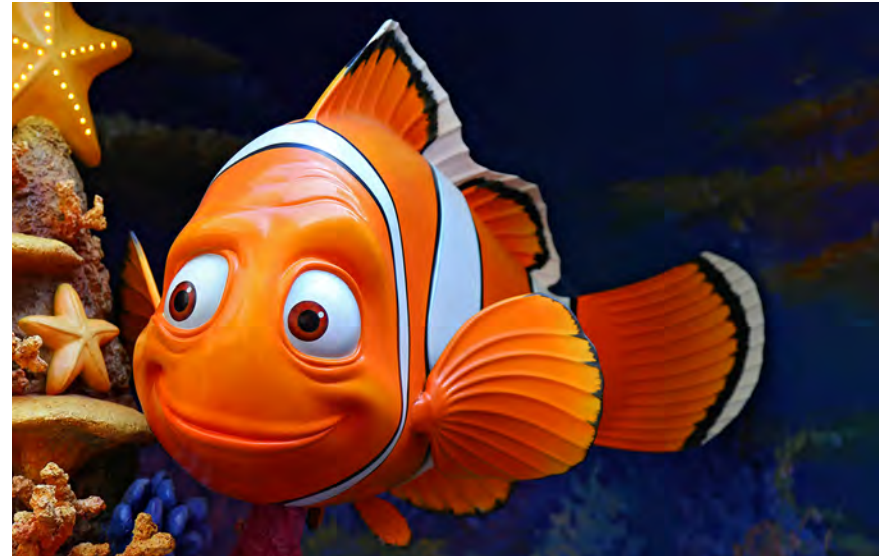
In Disney's "Finding Nemo," the main character is a young clownfish named Nemo.

So, Verne wrote Nemo's history another way with the captain as an Indian prince. The prince's family was killed during a rebellion against British rule. The prince renamed himself Nemo and builds the Nautilus as more than a submarine. He created a floating fortress of revenge against the powers that destroyed his life. He is like Batman with a nuclear submarine. He sails the oceans and sinks warships, while he lives in underwater luxury.