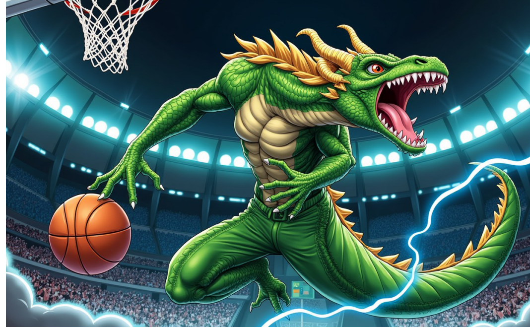
A “Frankenstein team” is stitched together with different players—with horrible results.

In sports, coaches and fans use “Frankenstein” to describe teams that are formed from players who don’t work well