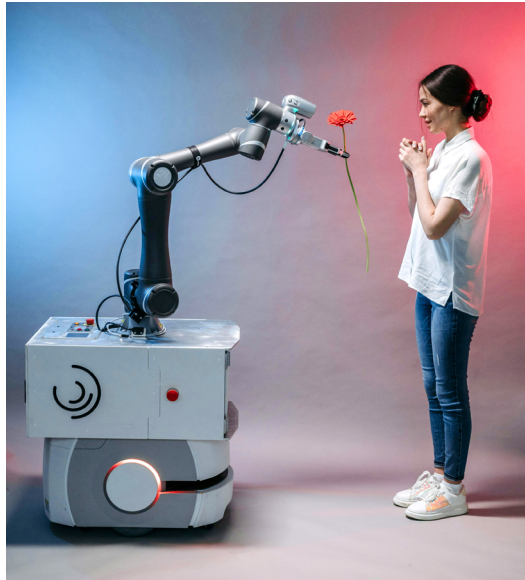
Computers might be able to mimic human behavior. But they do not have feelings like Frankenstein's creation.

But the differences are big. Frankenstein worked alone in secret, driven by his obsession. He never considered the results of his actions or what his creature might need.