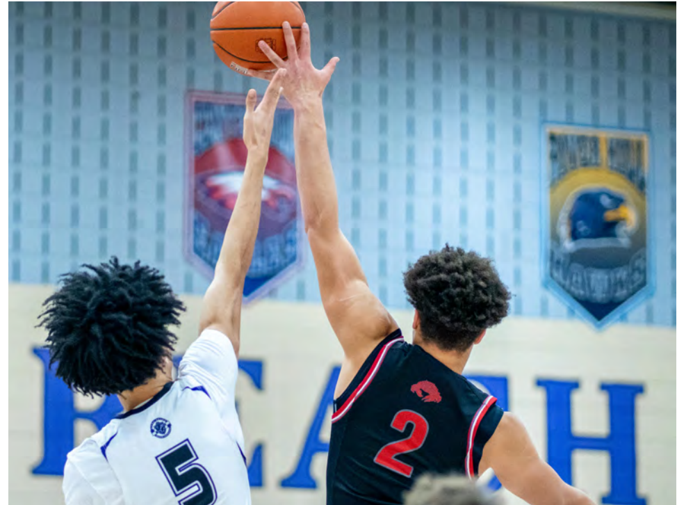
In Game , basketball is more than a game to high school senior Drew Lawson.

Coach House starts to give more playing time to Tomas, a white player from Europe. It feels unfair. Drew has worked hard and has skills, but now he's being pushed aside. This reminds him of how the character Iago works against Othello in the play. For Drew, basketball is his way to college and maybe the pros—just like being a general was Othello 's path to respect.