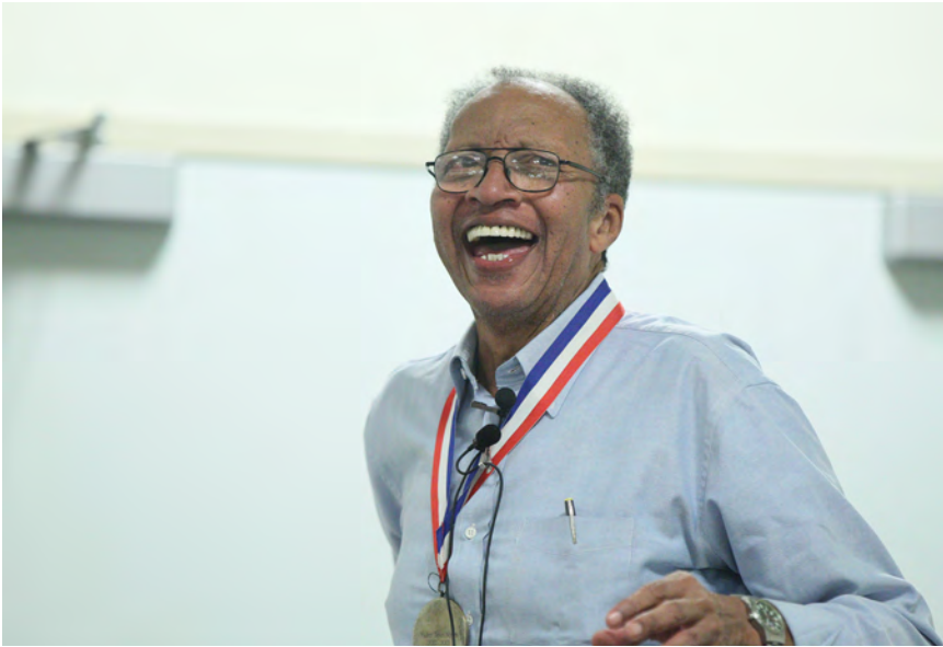
Walter Dean Myers