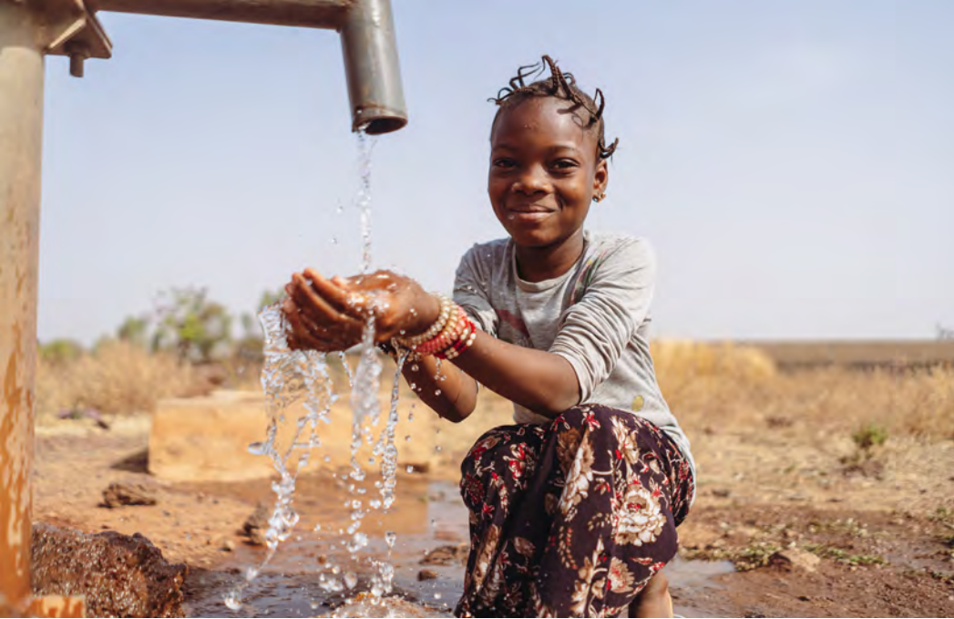
This girl is drinking fresh, clean water from a well in her village in Africa.