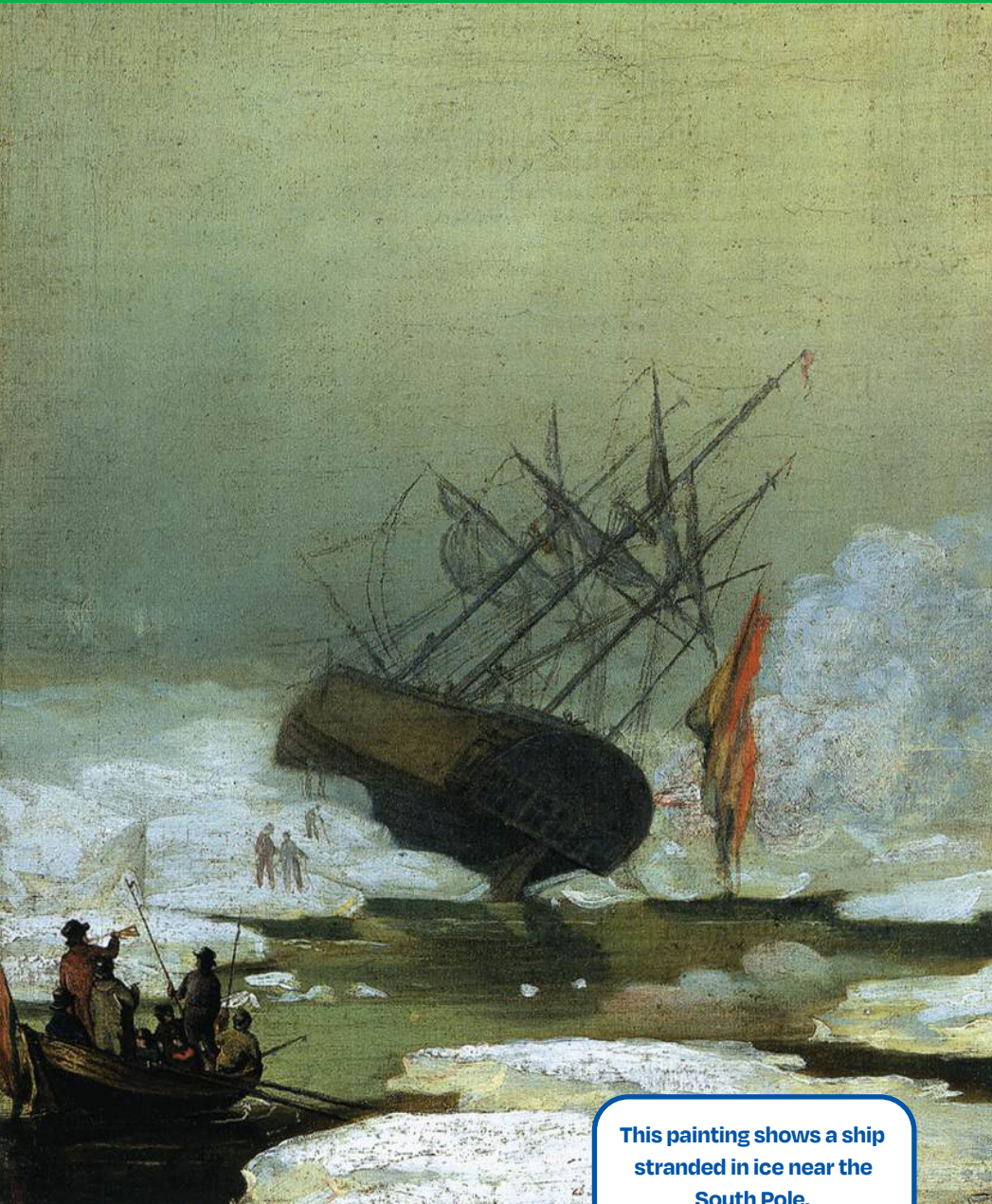
This painting shows a ship stranded in ice near the South Pole.