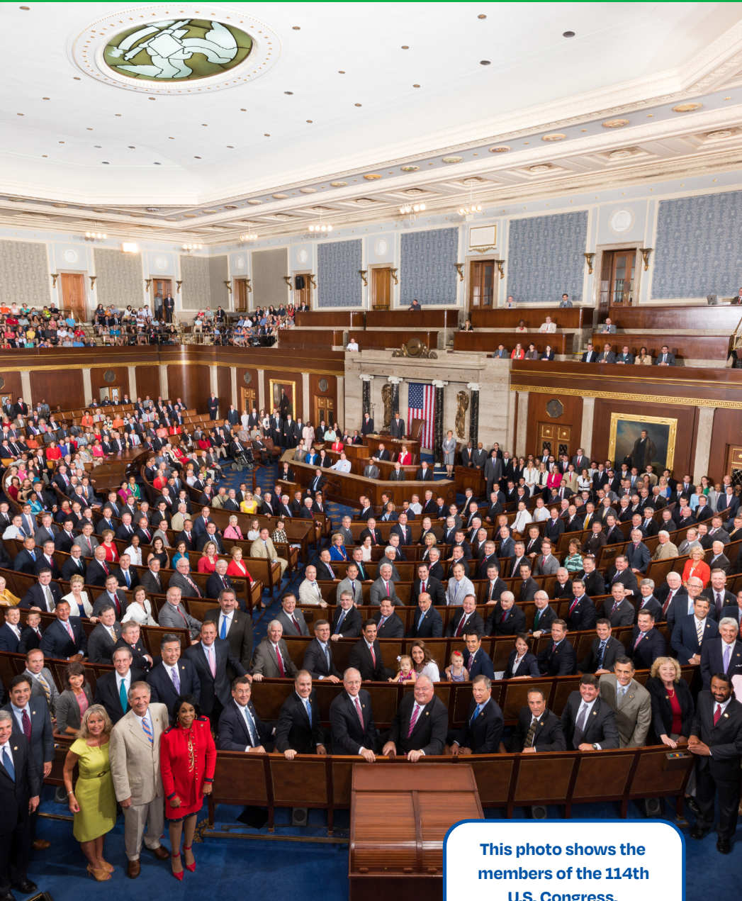
This photo shows the members of the 114th U.S. Congress.