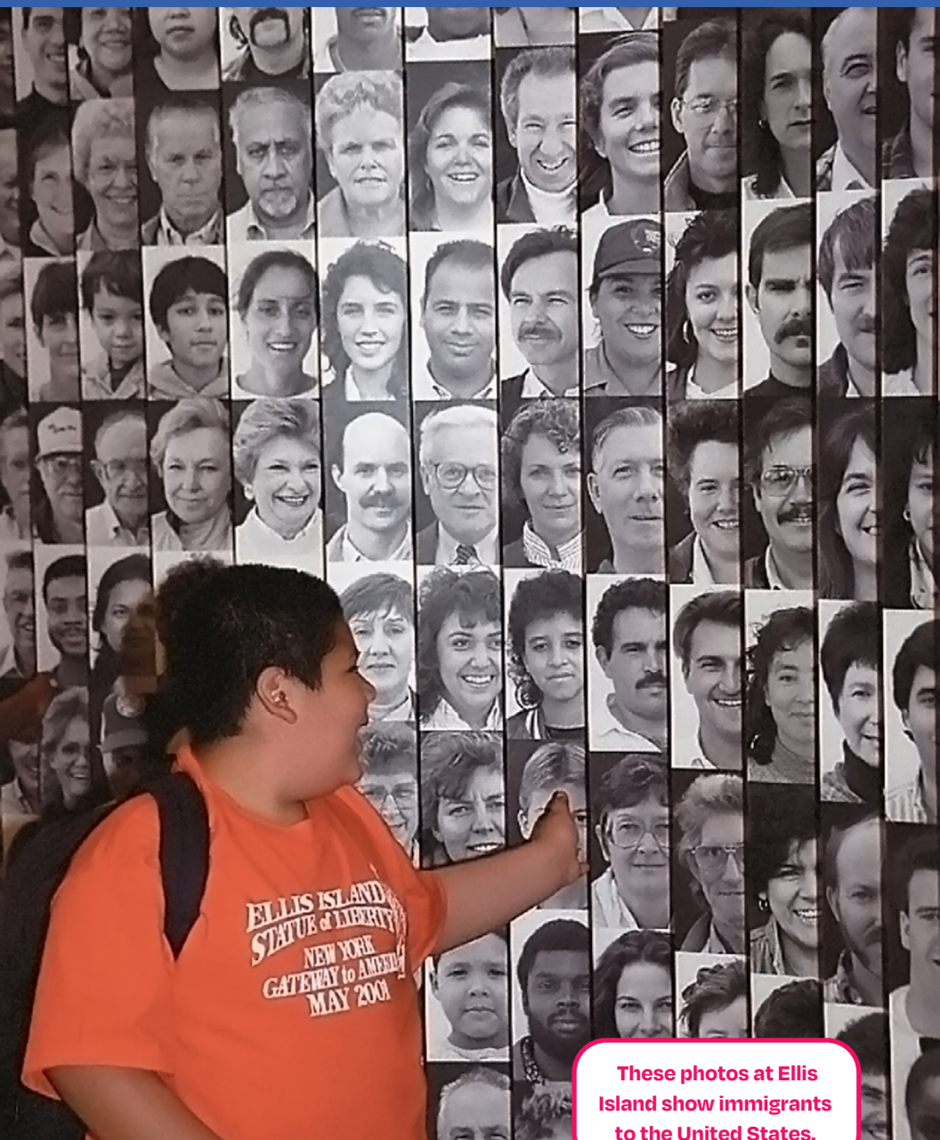
These photos at Ellis Island show immigrants to the United States.