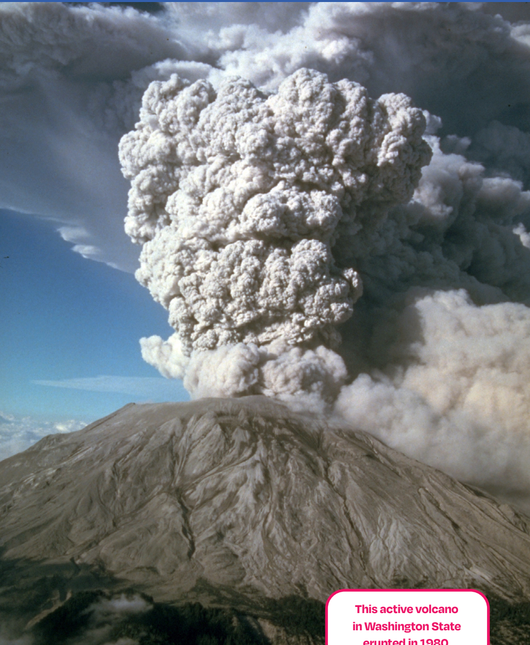
This active volcano in Washington State erupted in 1980.