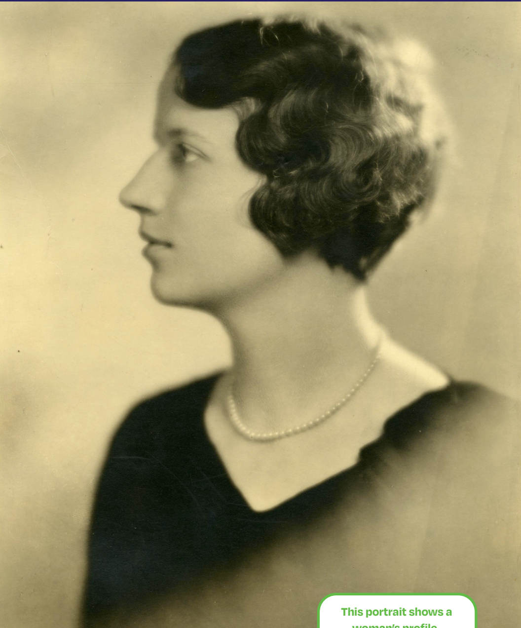
This portrait shows a woman's profile.