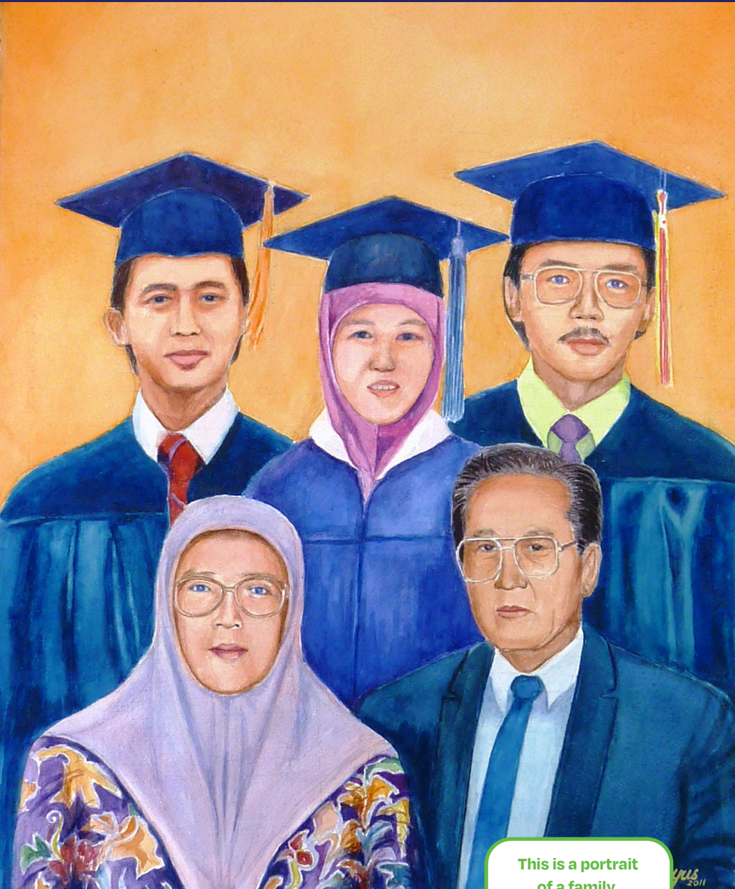
This is a portrait of a family.