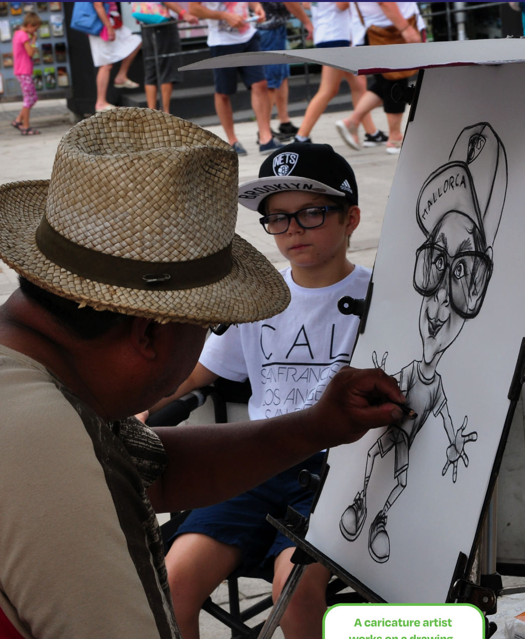
A caricature artist works on a drawing.