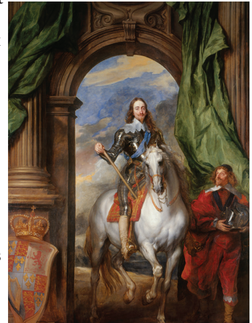
Painted in 1633 by Anthony van Dyke. Released into public domain due to an expired copyright.

Every state’s name has a history. What does your state’s name mean?